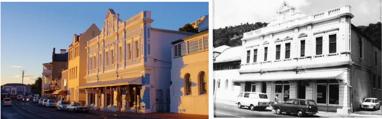
Runciman Building, St George's Street

This proposal seeks the inclusion of Simon's Town on the UNESCO World Heritage Tentative List in recognition of its outstanding universal value. The town's famed "Historic Mile" (a recognised Heritage Protection Overlay Zone) features a remarkably intact and densely concentrated collection of 18th and 19 th century buildings that remain in daily use, forming a vibrant living archive of colonial and post-colonial architecture. As the seat of the South African Navy and a crucial British Royal Navy base before that, Simon's Town has served for over two centuries as a strategic maritime hub at the crossroads of international trade, military, and oceanic exploration.