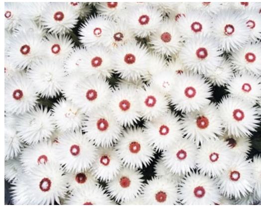
Cape Snow (Syncarpha vestita)