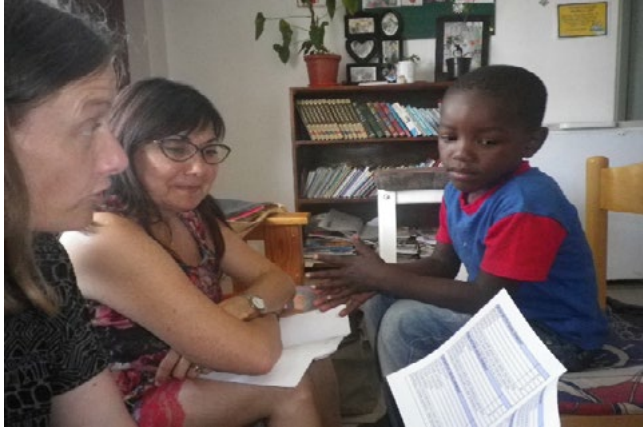
School Report Discussion

The children's educational needs are the Trust's greatest challenge! Some never attended school; others were well behind their grade average. A big effort was made to assess their lack of knowledge and to get them to a standard acceptable by mainstream or skills schools. One of the houses has a fully equipped classroom and the Trust employs a dedicated tutor to supervise homework, and a remedial tutor who works on helping bridge the gaps. Given the trauma experienced by the children's past, the Trust invests in additional counselling, and occupational, physical- and speech therapy. The children's psychological well-being is monitored along with their academic ability to enable the necessary interventions to be provided.