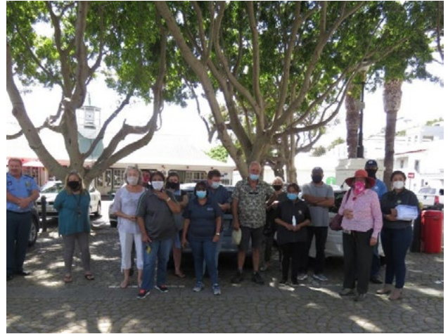
The Sub Council 19 Chairperson, Ward Councillor for Ward 61, Subcouncil 19 manager and staff wrote to the STCA to extend their gratitude and thanks to the STCA and all line departments for attending the Site Inspection.