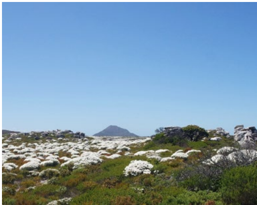
Cape Snow and rock formations

'Cape Snow' is definitely the star of November's show! There are still plenty of tiny treasures to be found if you look.