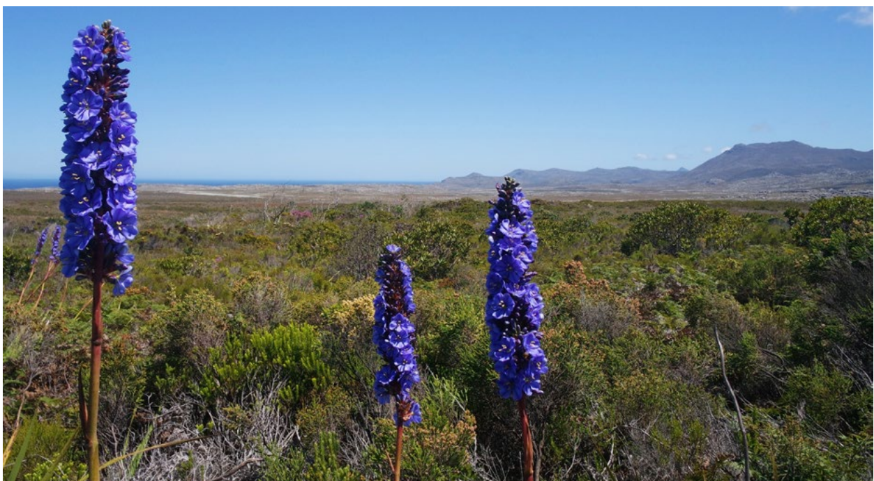
Aristea capitata at Cape Point

Visit our website: stca.wildapricot.org Facebook Page: SimonstownCivicAssociation Email: stcamail@gmail.com