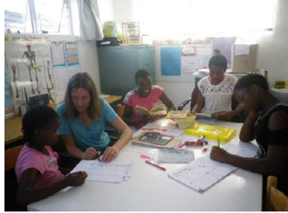
Working in the classroom